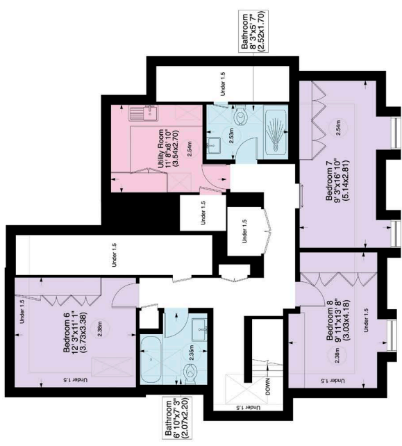
Second Floor - Approx 1015 Sq ft - 94 Sq m