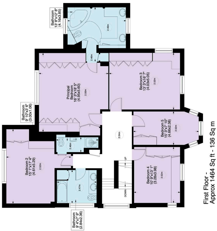
First Floor - Approx 1464 Sq ft - 136 Sq m

Not to Scale, for guidance only and must not be relied upon as a statement to fact. All measurements areas are approximate only (and have been prepared in accordance with the current edition of the RICS Code of Measuring Practice).