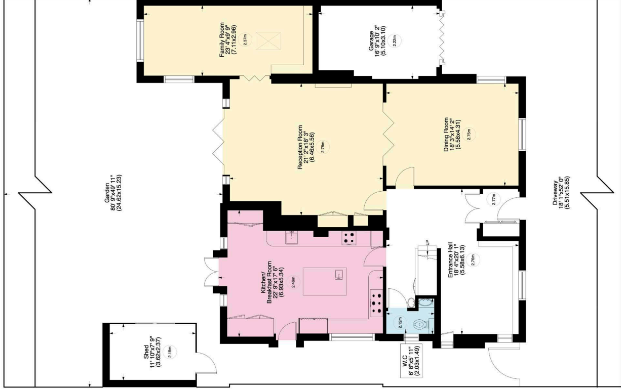
Ground Floor - Approx 1842 Sq ft - 171 Sq m